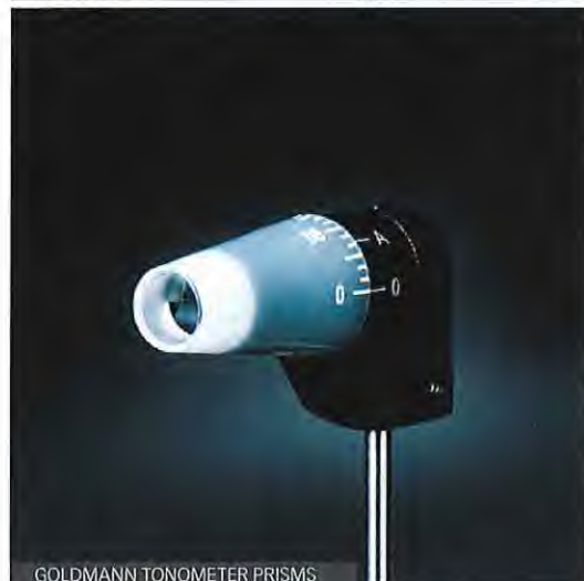
GOLDMANN TONOMETER PRISMS