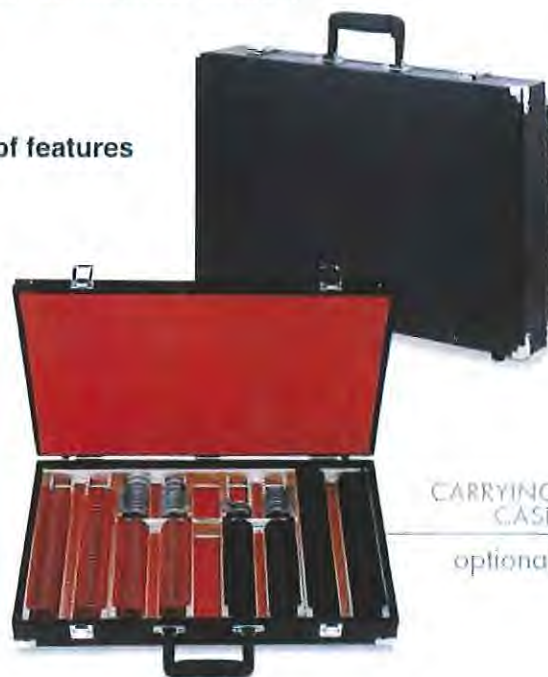
CARRYING CASE optional

The Corrective Curve Trial Lens Set comes in a sturdy holding tray with beveled slots for fast and easy insertion. The Deluxe Set includes minus and plus spherical lenses, prisms, other accessory lenses and various cylinder power lenses.