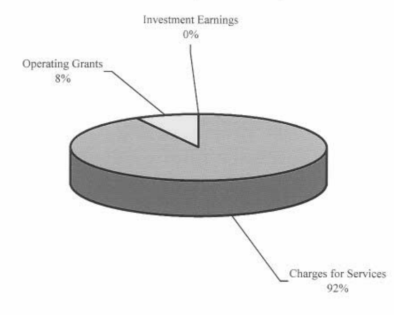
Table A-5: Revenues for Fiscal Year 2008 (See Table A-4)