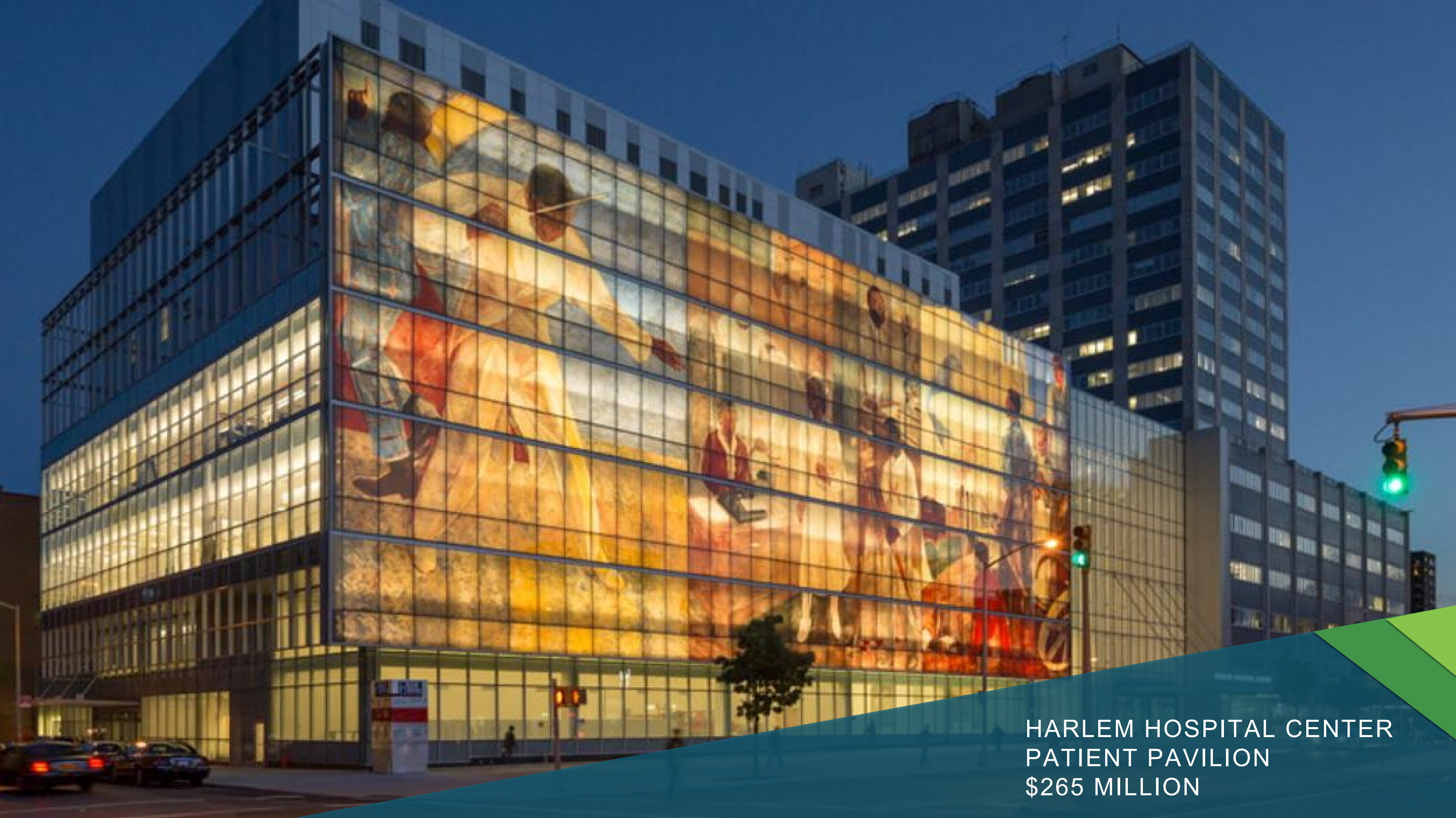
HARLEM HOSPITAL CENTER PATIENT PAVILION $265 MILLION