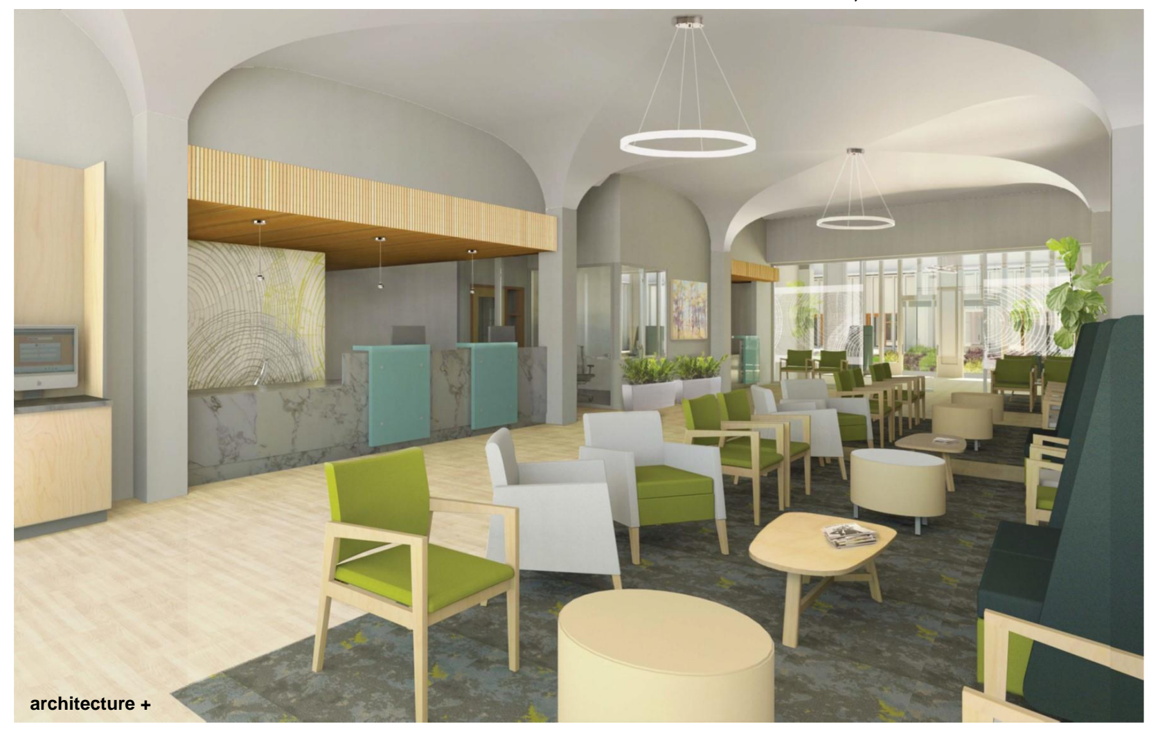
University at Albany - Dutch Quad Renovation

Construction Bid Forecast and Professional Services Contract Opportunities Fall, 2017