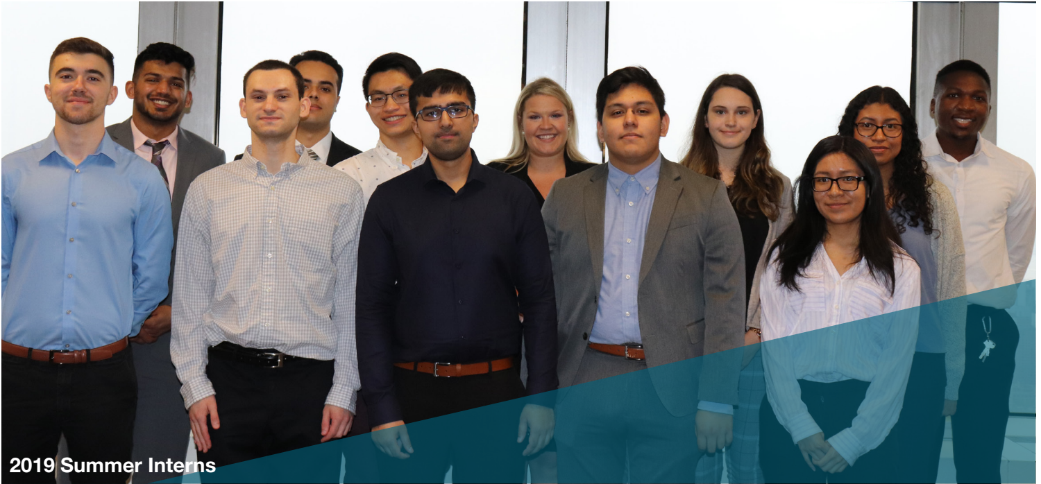
2019 Summer Interns

Serving at DASNY is not just a job, it is a mission. It is our mission to help make New York's communities sustainable, resilient and inclusive.