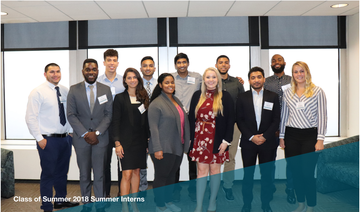
Class of Summer 2018 Summer Interns

“Serving at DASNY is not just a job, it is a mission. It is our mission to help make New York’s communities sustainable, resilient and inclusive.”