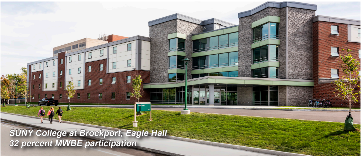
SUNY College at Brockport, Eagle Hall 32 percent MWBE participation

“DASNY’s support of our firm as a WBE has opened doors that have allowed us to transition from providing sustainable engineering and architecture in a supporting role to leading design and energy projects throughout Upstate New York.”