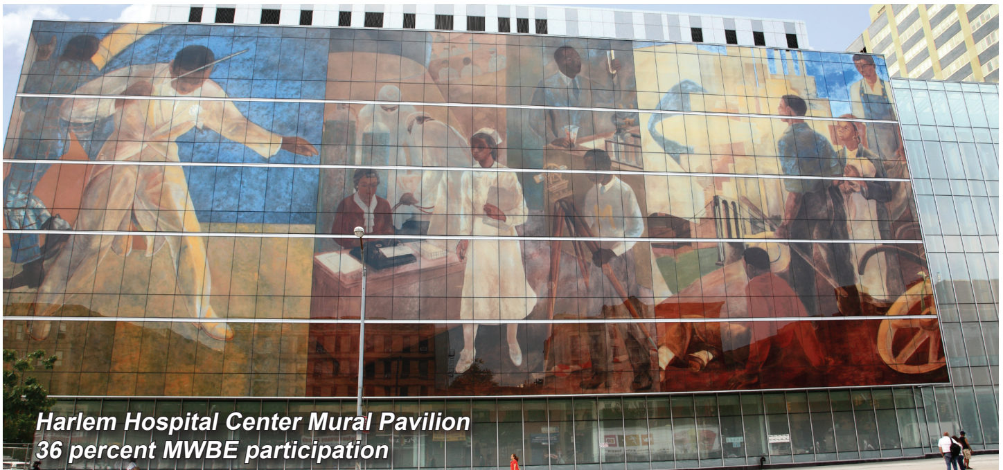
Harlem Hospital Center Mural Pavilion 36 percent MWBE participation