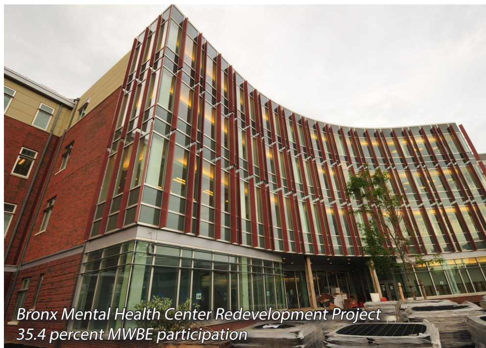
Bronx Mental Health Center Redevelopment Project 35.4 percent MWBE participation

“At DASNY, we are firmly committed to provide real opportunities for MWBE and SDVOB companies to compete. Enhancing and expanding our programs for these business communities in the fields of construction, as well as financial, legal and professional services, will support the development of the next generation of robust and diverse enterprises in New York State.”