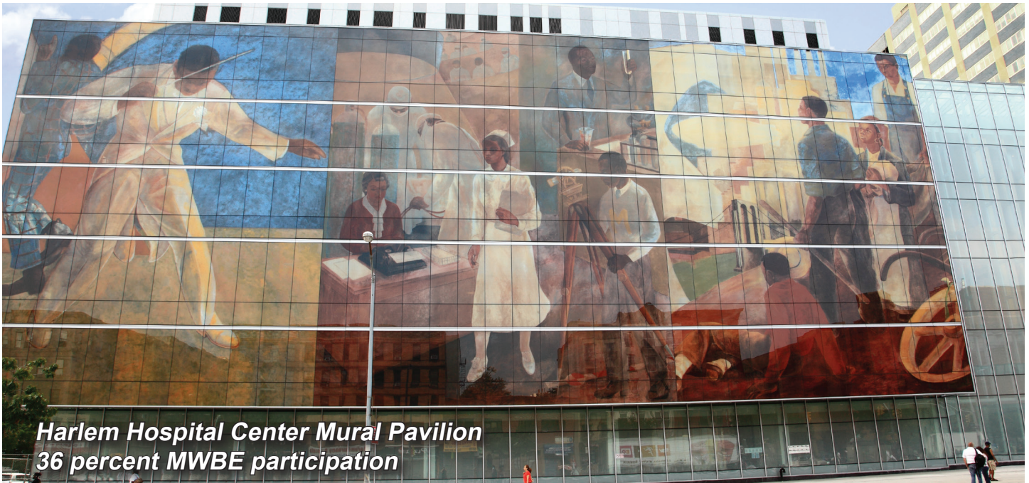
Harlem Hospital Center Mural Pavilion 36 percent MWBE participation