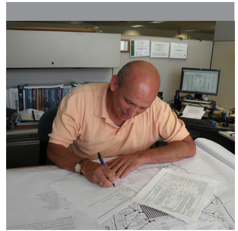
On the cover: Bronx Community College North Instructional Building: 33 percent MWBE participation.

*Registration with DASNY is independent of and not related to any other registration, classification or certification by other local, state or federal government entities. Firms must be certified as a MWBE with the New York State's Empire State Development (ESD) in order to count toward state MWBE participation goals on DASNY Contracts.