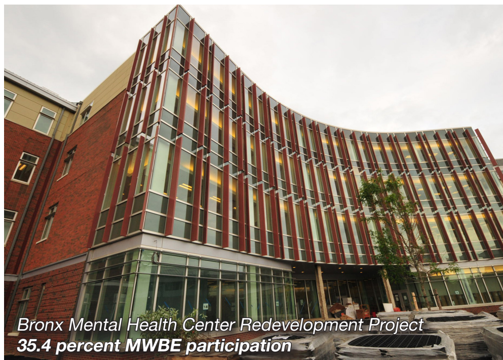
Bronx Mental Health Center Redevelopment Project 35.4 percent MWBE participation

“At DASNY, we are firmly committed to provide real opportunities for MWBE and SDVOB companies to compete. Enhancing and expanding our programs for these business communities in the fields of construction, as well as financial, legal and professional services, will support the development of the next generation of robust and diverse enterprises in New York State.”