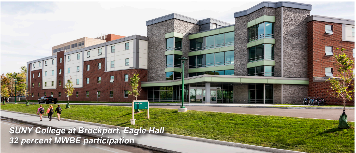
SUNY College at Brockport, Eagle Hall 32 percent MWBE participation

“DASNY’s support of our firm as a WBE has opened doors that have allowed us to transition from providing sustainable engineering and architecture in a supporting role to leading design and energy projects throughout Upstate New York.”