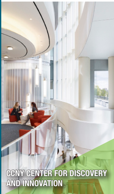
CCNY CENTER FOR DISCOVERY AND INNOVATION

By working at DASNY, you help create the foundation that enables New York to compete in the 21 st century.