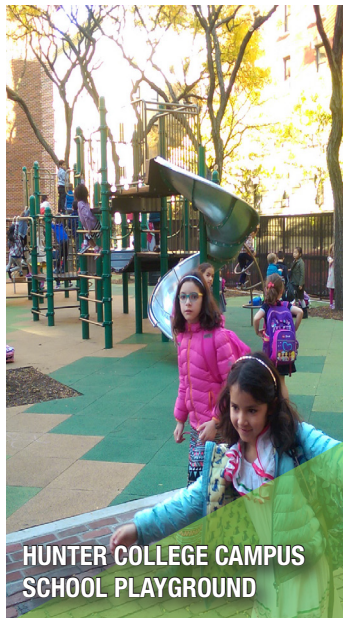
HUNTER COLLEGE CAMPUS SCHOOL PLAYGROUND