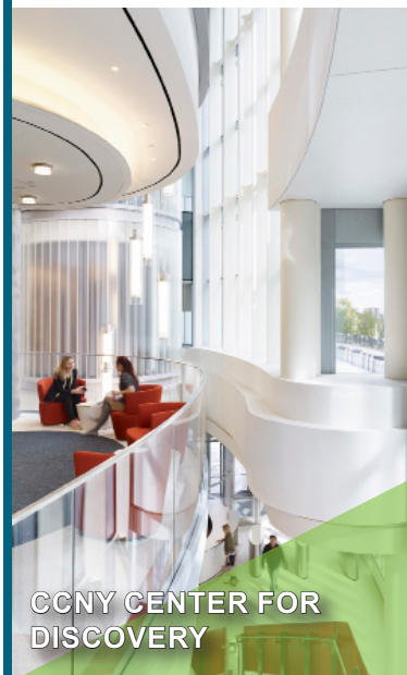
CCNY CENTER FOR DISCOVERY