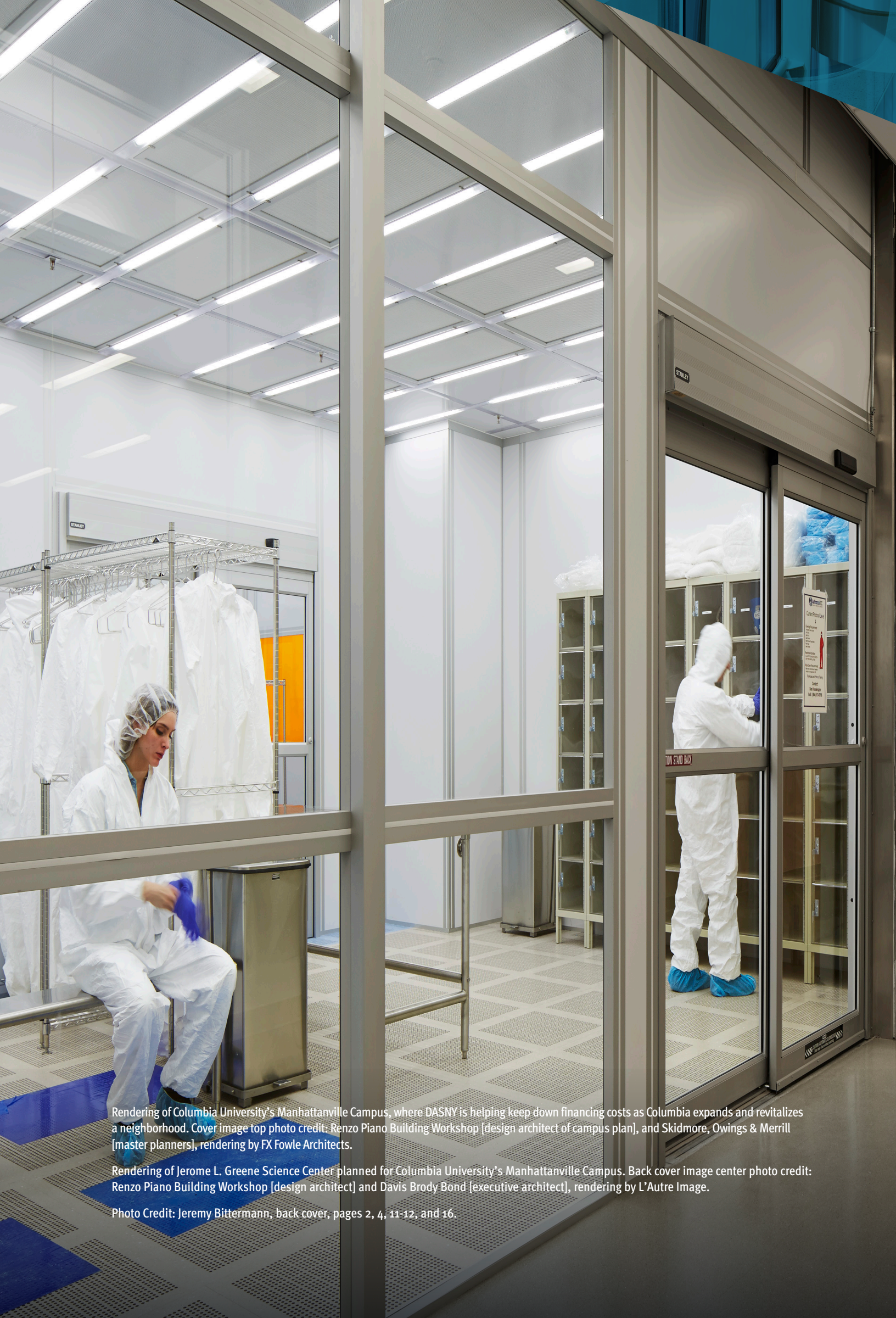
Rendering of Columbia University's Manhattanville Campus, where DASNY is helping keep down financing costs as Columbia expands and revitalizes a neighborhood. Cover image top photo credit: Renzo Piano Building Workshop [design architect of campus plan], and Skidmore, Owings & Merrill [master planners], rendering by FX Fowle Architects.