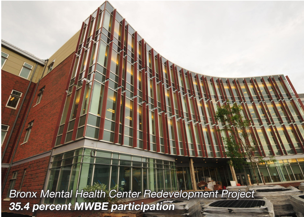
Bronx Mental Health Center Redevelopment Project 35.4 percent MWBE participation

“At DASNY, we are firmly committed to provide real opportunities for MWBE and SDVOB companies to compete. Enhancing and expanding our programs for these business communities in the fields of construction, as well as financial, legal and professional services, will support the development of the next generation of robust and diverse enterprises in New York State.”