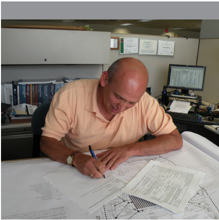
On the cover: Bronx Community College North Instructional Building: 33 percent MWBE participation.

The City University of New York (CUNY) Set-Aside Program designates purchases and contracts for construction and services at four CUNY campuses to be bid by minority and small businesses only. The set-aside campuses are: Bronx and Hostos Community Colleges, Medgar Evers College and York College . Participating small and minority-owned businesses can gain experience in major long-term capital construction projects needed to more effectively compete in the open market. DASNY has a 25 percent participation requirement for Minority Business Enterprises (MBE) and small subcontractors and suppliers on work designated as Set-Aside.