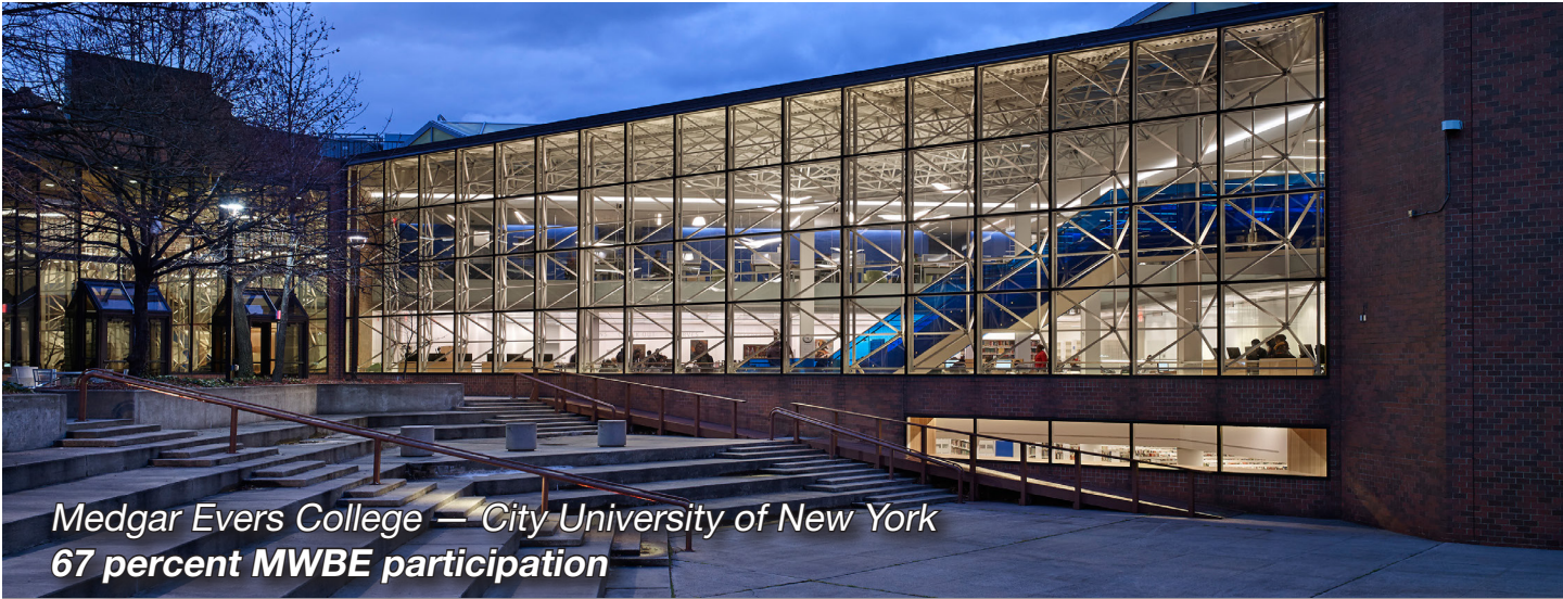
Medgar Evers College — City University of New York 67 percent MWBE participation

DASNY's commitment to women-owned businesses (WBEs) has afforded Meadows the opportunity to work on many large-scale state projects. Those projects have set a platform where we have been able to gain an understanding of how our products and services can best accommodate various state agencies, which in turn has led to many long-term business relationships for us. Thanks to DASNY, we are now one of the largest WBE firms in New York City.