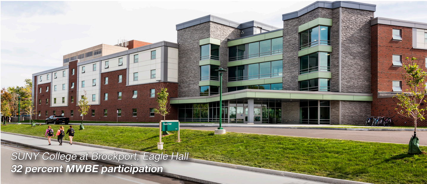
SUNY College at Brockport, Eagle Hall 32 percent MWBE participation

“DASNY’s support of our firm as a WBE has opened doors that have allowed us to transition from providing sustainable engineering and architecture in a supporting role to leading design and energy projects throughout Upstate New York.”