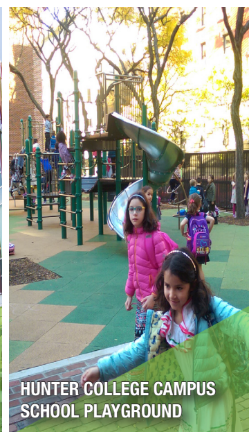
HUNTER COLLEGE CAMPUS SCHOOL PLAYGROUND