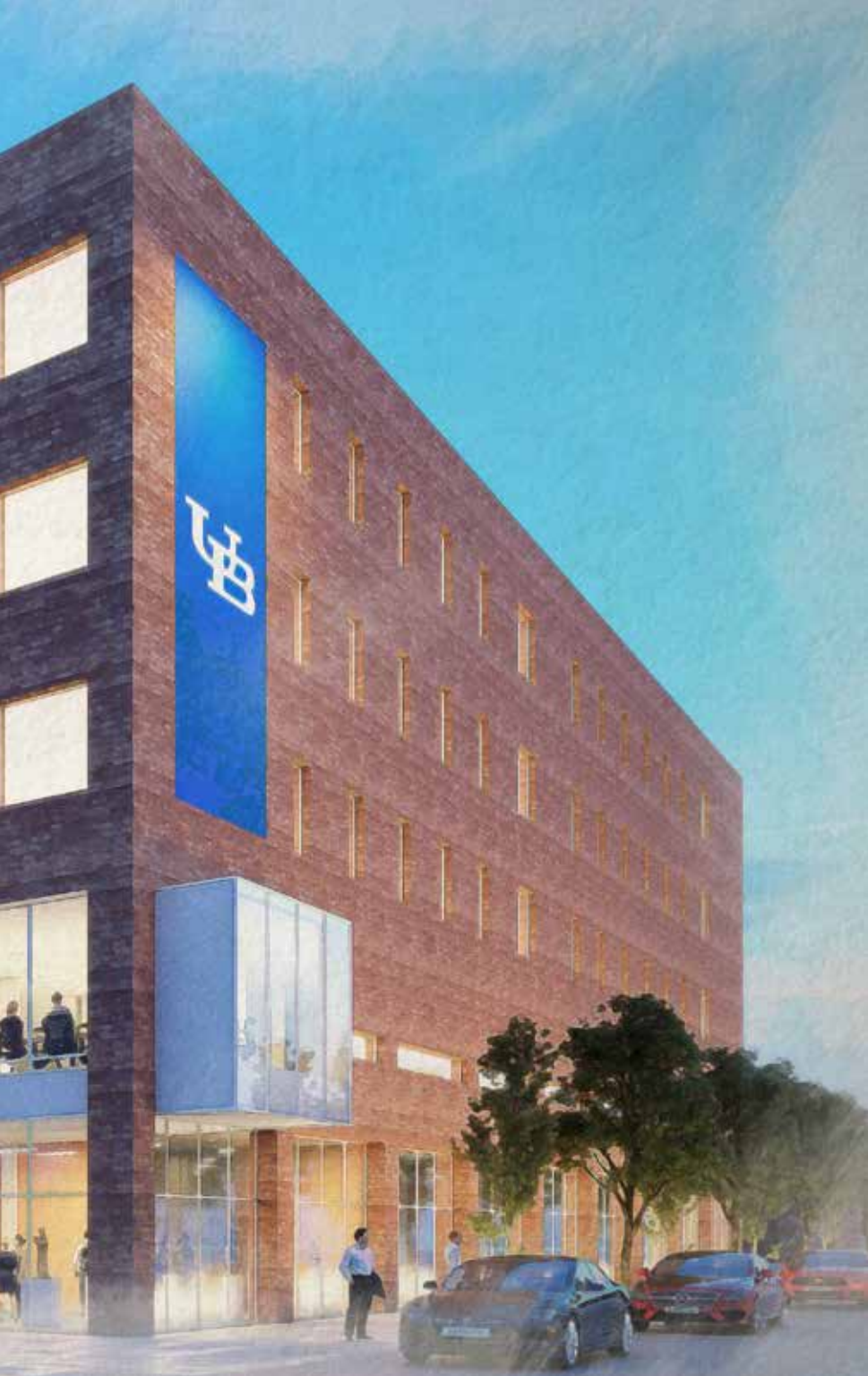
a new west entry for lockwood library