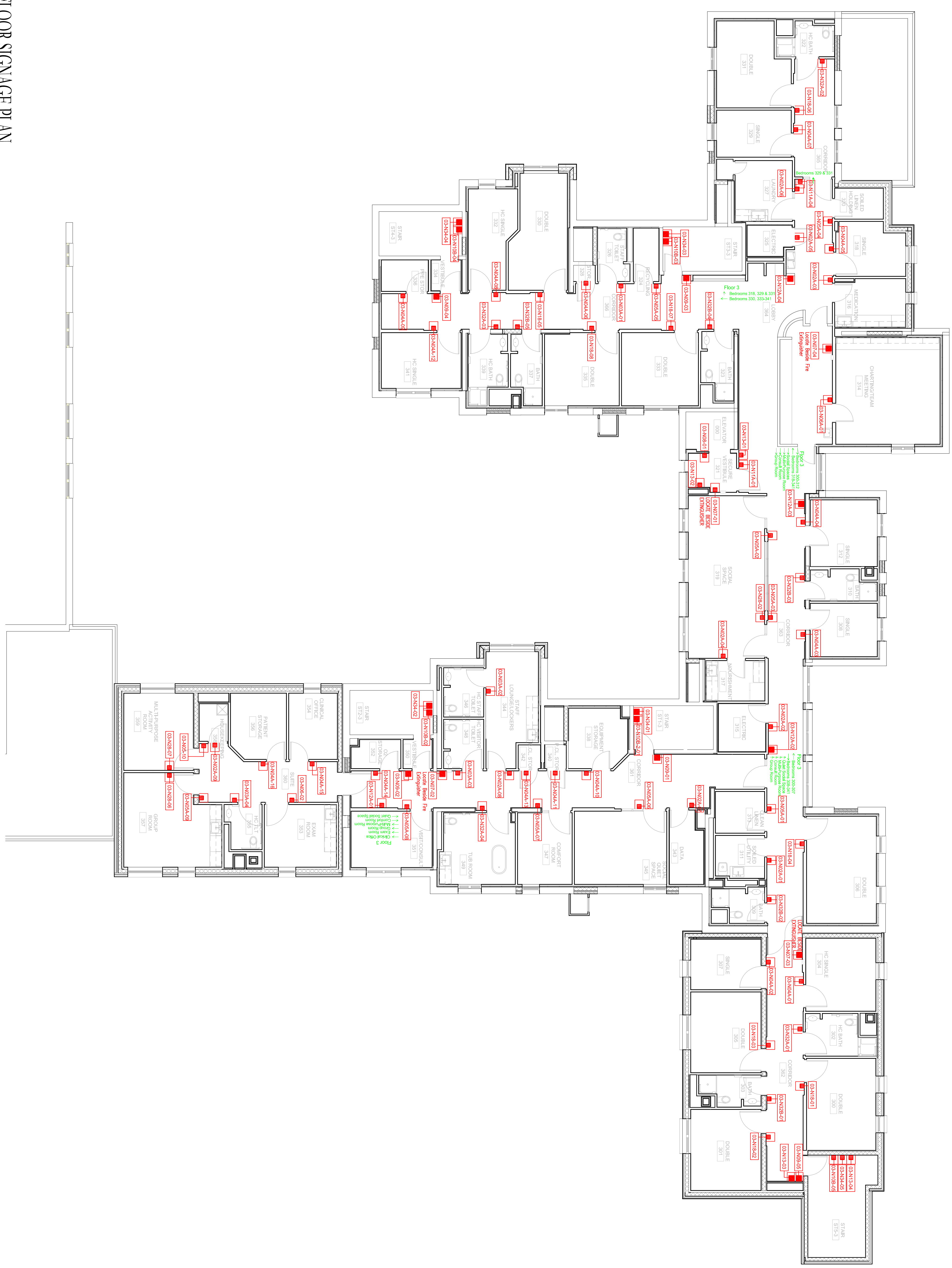
THIRD FLOOR SIGNAGE PLAN SCALE: 1/8" = 1'-0"